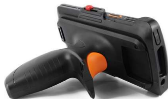
PN: TR50 Trigger pistol grip for DT50/Q/X/S (terminal not included)