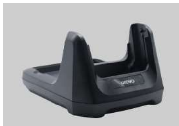
PN: HBCDT50B-1/2 Cradle for DT50/Q/X/S