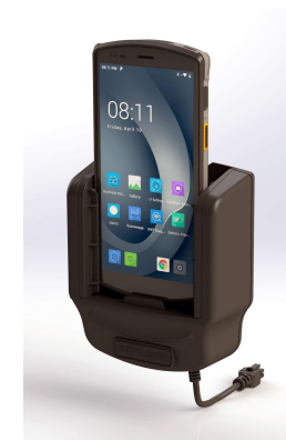
PN: Various Active vehicle cradle (compatible with DT50/Q/X/S)