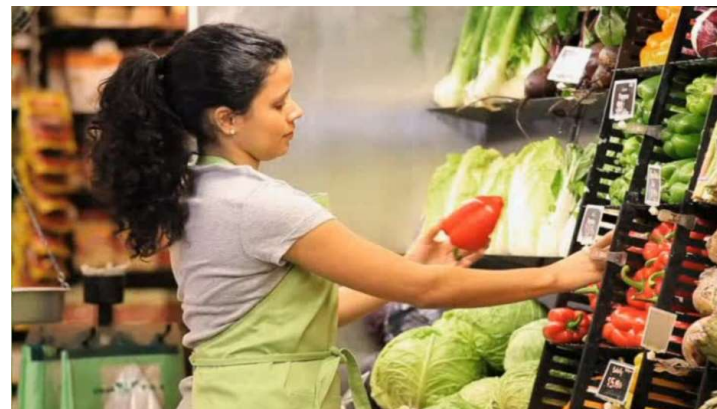
Retail inventory and price check