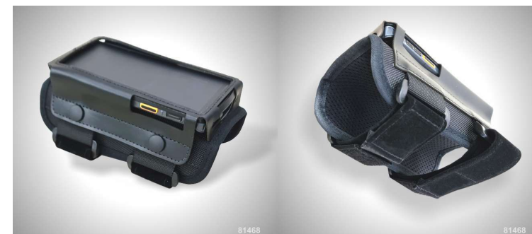
PN: TBD Armband holster for DT50/Q/X/S/H