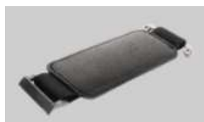
PN: 3.01.51.00088 Hand strap for DT50/Q/X/S/H