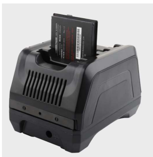
PN: 4BCDT50-1/2 4-slot battery charging cradle (for 4300mAH battery only)