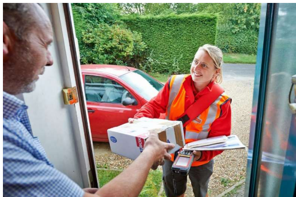
Pickup and Delivery