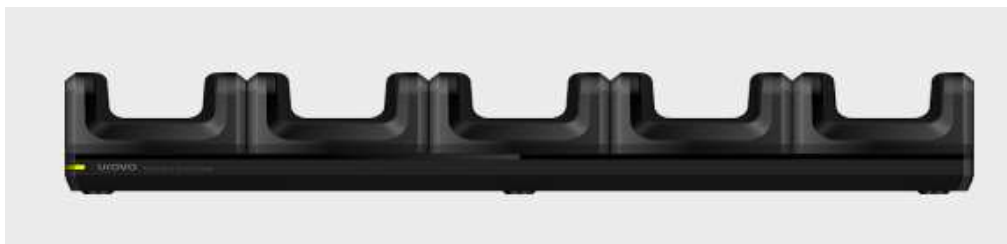
PN: 5BCDT5001-1/2 5-slot terminal charging cradle (compatible with DT50/Q/X/S/D/H and TR50)