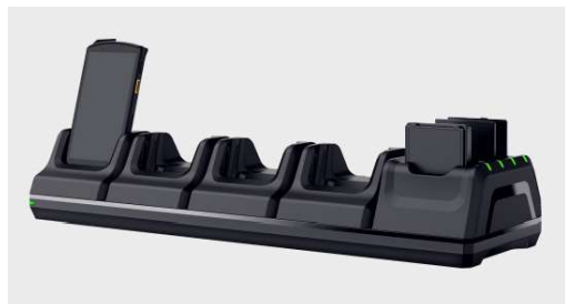
PN: 5BCDT5002-1/2 4-slot terminal and 4-slot battery charging cradle (compatible with DT50/Q/X/S/D/H, TR50 and 4300mah battery)