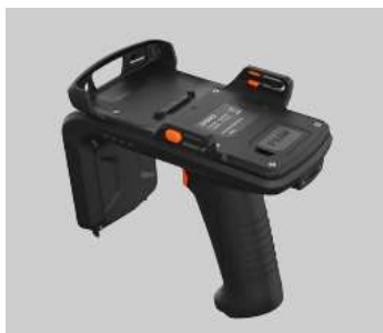
PN: RFDT50-1/2 UHF sled for DT50/Q/X/S