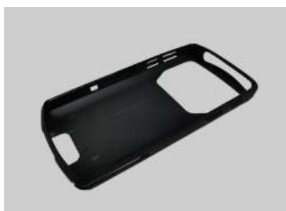
PN: 3.01.272.40001 Protective cover for DT50/Q/X/S