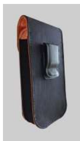
PN: 3.01.272.10002 Holster for DT50/Q/X/S/H/D