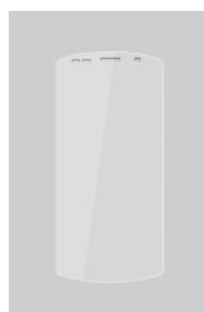
PN: RFDT50-1/2 Screen protector for DT50/Q/X/S/U/H/D