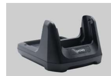
PN: HBCRFDT50-1/2 Cradle for RFDT50 and terminal