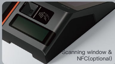
Scanning window & NFC(optional)