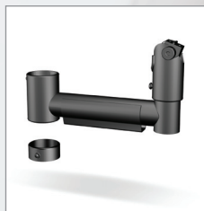
Swingarm DuraTilt SPV2102