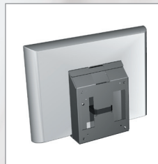
Wall mount straight SPV1107