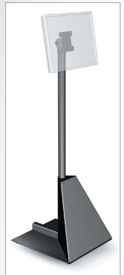
Floor mount SPV1109