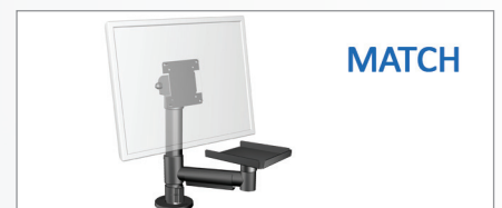
PICK a peripheral swing arm