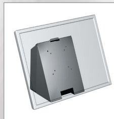
Wall mount angled SPV1108