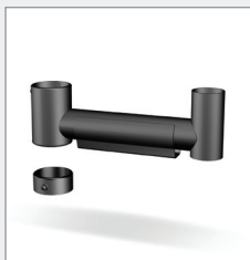
Swingarm peripheral SPV2101