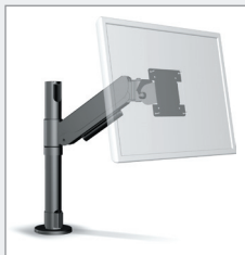
Height adjustable SPV1105