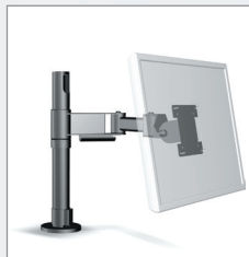
Elbow arm SPV1106