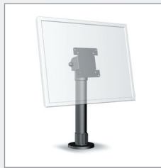
Screen top mount SPV1102