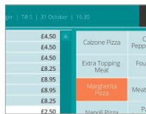
• Vibrant 15" PCT Display.

The Sam4s Sapphire offers vibrant & precise 15" projected capacitive multi-touch display and is extremely durable in most environments including withstanding water contact, dust & grease (IP55 Rated).