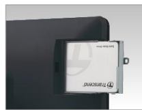
• Easy Access to SSD.

Incorporating the latest "fanless" Celeron processor from Intel. The SAM4S Sapphire is one of the fastest & quietest PC POS terminals in its class. Providing efficient and reliable Point of Sale technology.